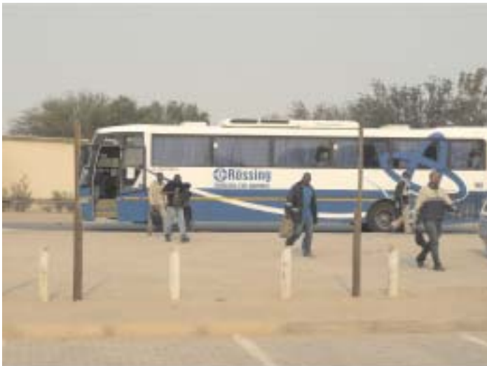
Rössing workers getting off the company bus in Arandis

Rössing has a lucrative package and who can say no to that. I was actually asked by my foreman to come back and train others and I came back because other offers could not match Rössing (current worker).