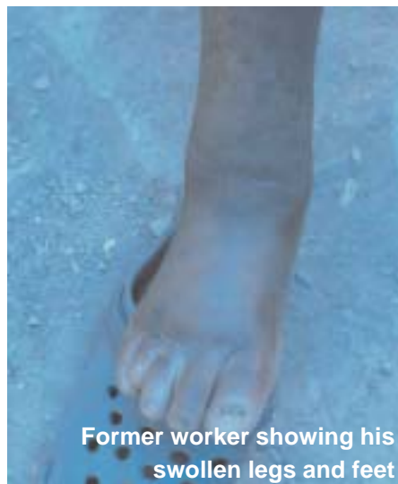
Former worker showing his swollen legs and feet

Meanwhile, the manager of external affairs at Rössing maintained that the annual health checks conducted by the company were credible. Through the health checks, the company claims to trace the health conditions of their workers and therefore 'the company cannot take responsibility if a person gets sick after leaving the employment of Rössing, because regular annual health checks are performed' . Workers nevertheless claimed that many times, their colleagues were laid off when the company knew their health had deteriorated.