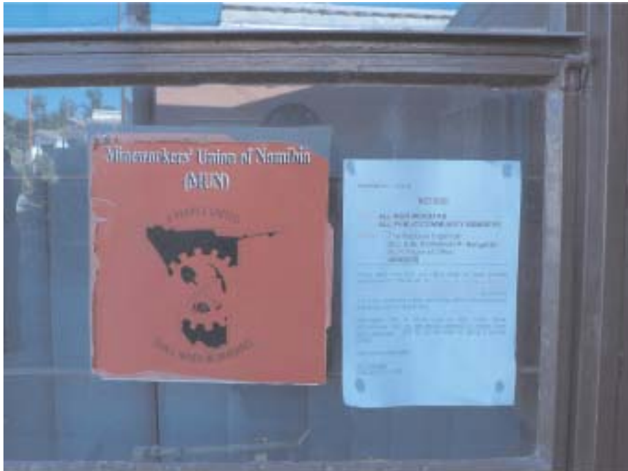
MUN office in Arandis

The Mine Workers Union of Namibia (MUN) is a recognized bargaining agent for mine workers in Namibia. The MUN is also the only sole bargaining agent on behalf of workers at Rössing.