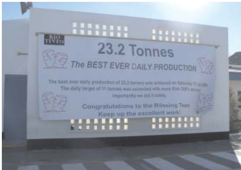
Highest daily production achieved at Rössing

The increased diversification of Namibia's mining sector away from diamonds is a very healthy development for the future of our country (New Era, 24 April, 2007).